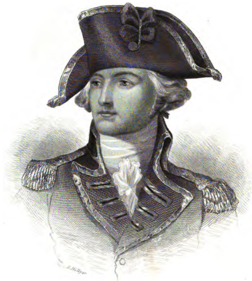
LT GEN. BURGOYNE.