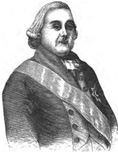
MAJ. GEN. FRIEDRICH ADOLPH RIEDESEL.