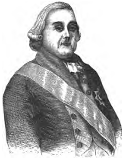
MAJ. GEN. FRIEDRICH ADOLPH RIEDESEL.